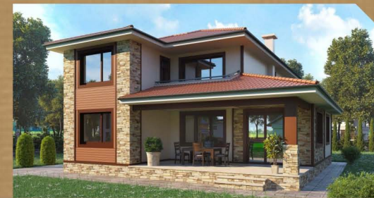
Lake View Houses