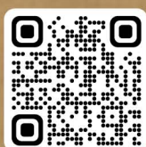
SCAN FOR SITE LOCATION