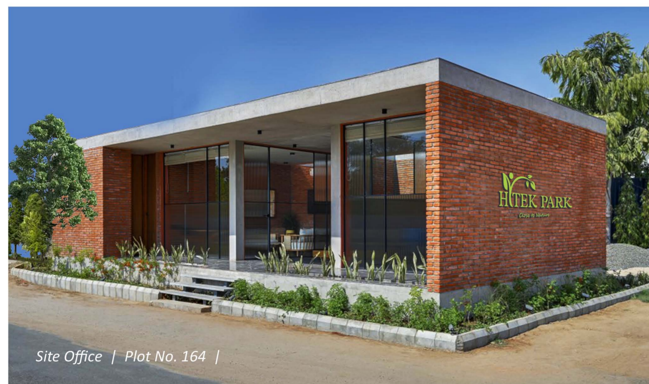
Site Office | Plot No. 164 |